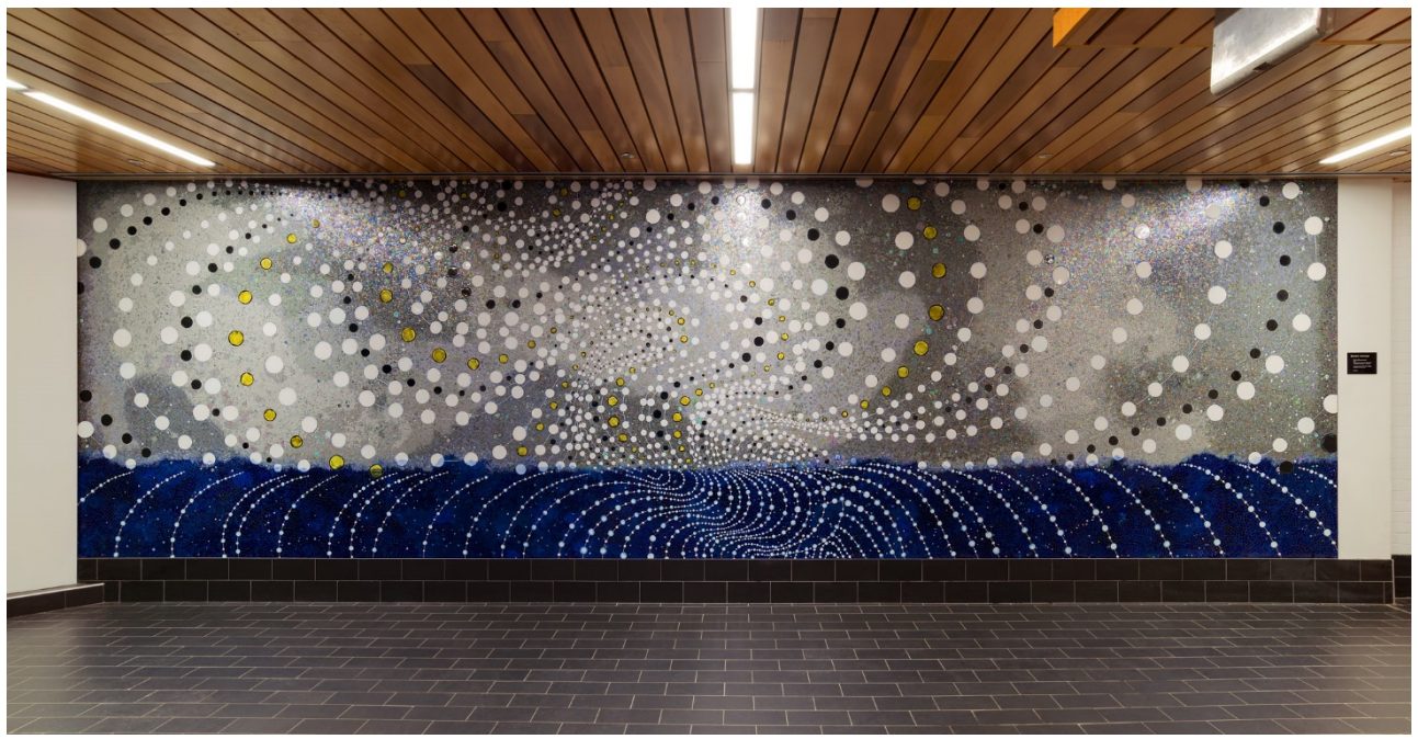
Forte (Quarropas) (2020) © Barbara Takenaga, MNR White Plains Station. Commissioned by MTA Arts & Design.

(NEW YORK, NY — October 21, 2021) MTA Arts & Design is pleased to announce new artwork for the Metro-North Railroad station in White Plains. The mosaic and laminated glass work by celebrated artist Barbara Takenaga for the White Plains Station features the artist's signature stylized abstract forms. The piece's deep vibrant blue undulating movement references rail travel, the history of the city, and its exuberant energy.